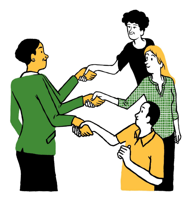
Bosses should take time to get to know their employees all over again, to assess how they have grown or changed. ILLUSTRATION: MARTIN TOGNOLA

All these changes add up to a challenge for managers, who will need to think differently about how to mentor and coach their team members effectively as they return to the office. Their employees might look like the same people. But rest assured, many aren't.