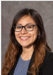
Stephanie Hartfield Student Housing