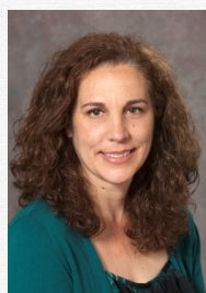
Lenora Bruce School of Education