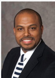
Fitz King Compliance Unit